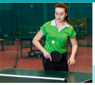
Table Tennis 🏜

Table tennis is a fun and fast sport with a development focus on hand-eye coordination that helps each player to further progress within this sport. Competitions will be available to all. We are happy to announce that our clubs will be run by high quality coaches from Castelldefels Table Tennis Club, where our students can also represent in many competitions and festivals both inside and outside of BSB.